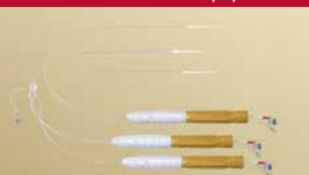
The Aortic Bifurcate Delivery System working length: 54 cm Iliac Limb Delivery System working length: 77 cm